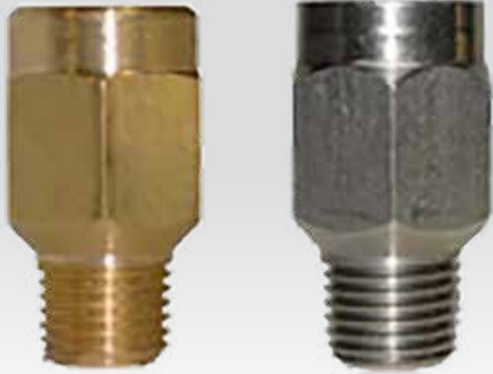
Model 'FTS' Filter Type Snubber