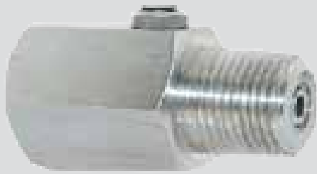
Pressure Snubber with Choke Valve