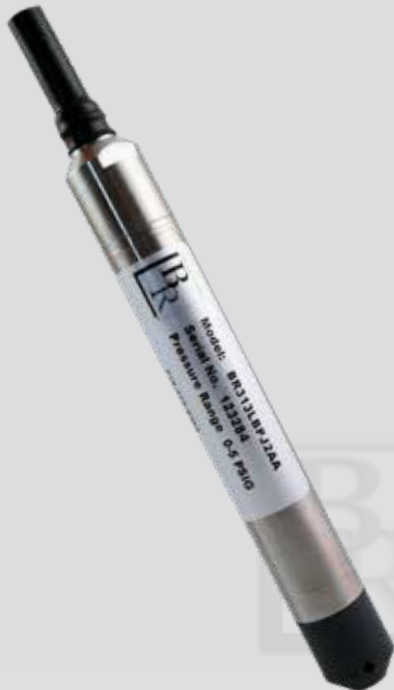
Model BR313L Submersible Level Transmitter