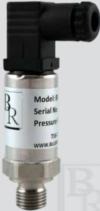
Model BR1001/1002/1003 Low-Cost OEM Pressure Transducer