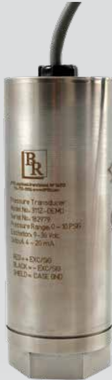
Model BR311 I, GI, AI Intrinsicly Safe Pressure Transducer