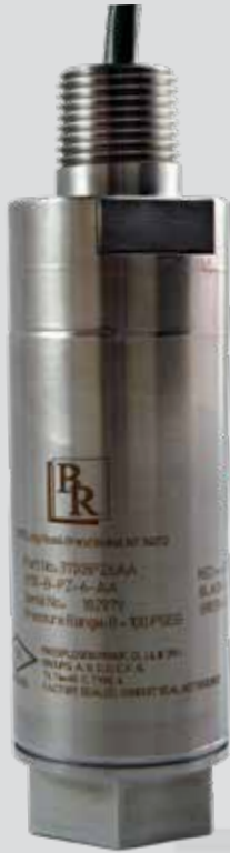
Models 111X/P, 211X/P, 311X/P & 311N/AN/GN Explosion Proof & Zone 2/Div 2 Pressure Transmitter