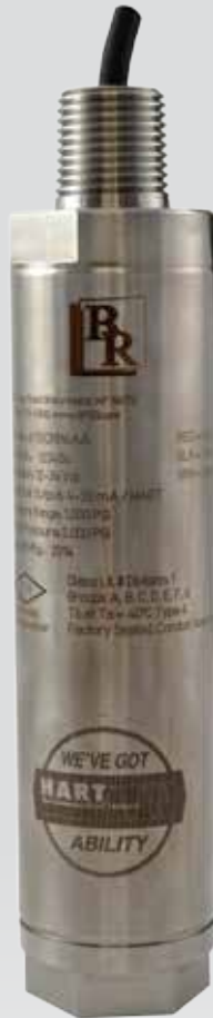
Model BR411, 411XP Smart Rangeable Pressure Transmitter