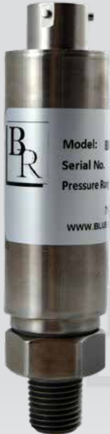
Model BR241 / 341 High-Accuracy Pressure Transducer