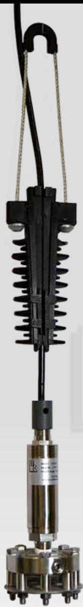
Model BCH2000 Cable Hanger

The Model BCH2000 Cable Hanger from Blue Ribbon Corporation is designed to eliminate unnecessary stresses on the transmitter while installed in the application. Affordably priced, the BCH2000 Cable Hanger is designed for easy installation within a variety of environments.