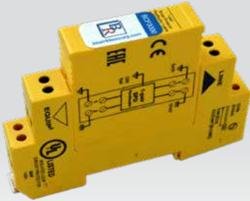
Model BCP3000 Birdcage® Series Surge Protector