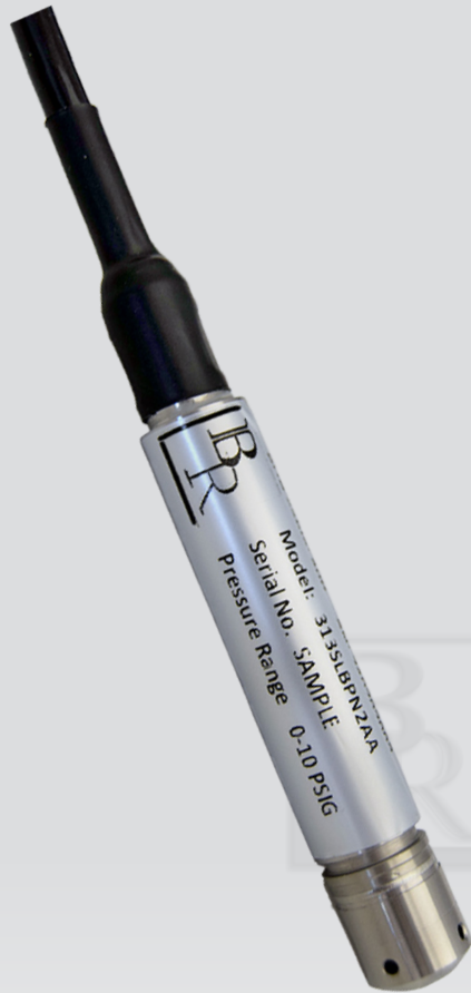
Model BR313SL Slim Submersible Level Transmitter