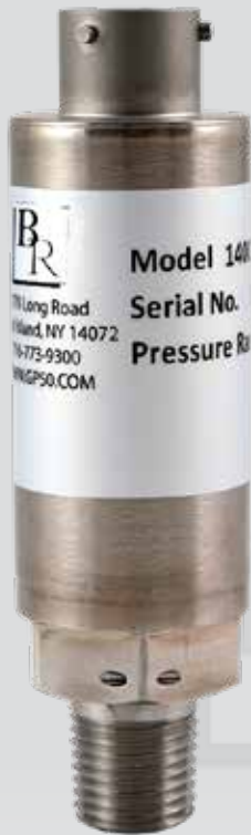
Model BR140 / 240 / 340 Compact Industrial Pressure Transducer